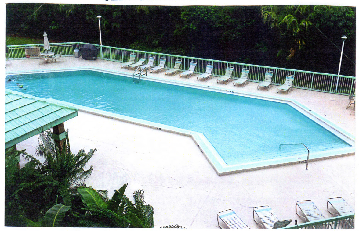
NEW POOL PAVERS